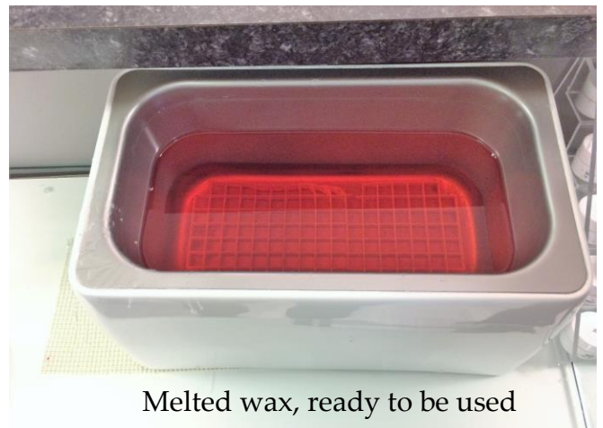
Melted wax, ready to be used

Open the bag wide, then cinch it at the top to trap air inside it. Shake the bag to distribute the wax onto all of its surfaces. Put the client's hand into the bag, form the wax around the hand to ensure complete coverage and remove excess air. Seal the bag around the wrist. Wrap the hand in something warm, such as heated towels or mittens. Heated towels and mittens extend the warmth, thereby improving the effectiveness of the treatment. Leave the client for approximately 10 minutes. During this time, the apprentice can clean their tools and perform other tasks.