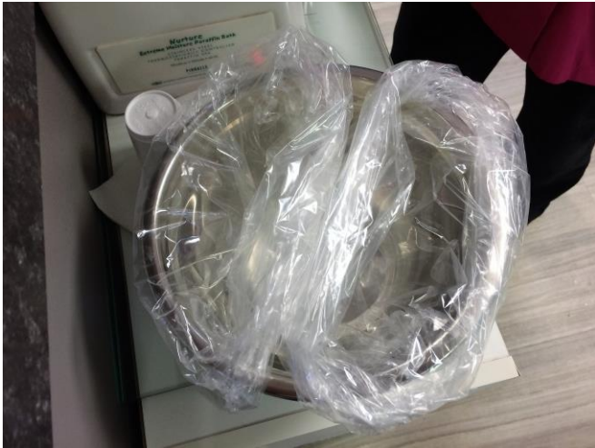
Plastic bags prepared for filling with wax

from the heater and pour it onto the underside of the wrist. The skin on the underside of the wrist is very sensitive. If it does not hurt in this location, it should be safe to use on the client.