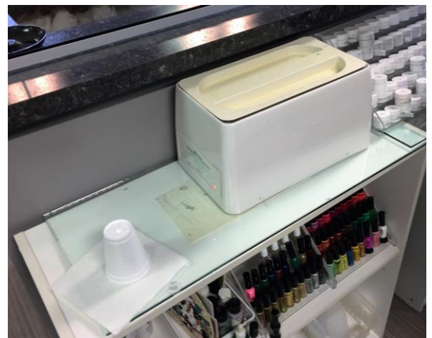
Paraffin station, with wax warmer and disposable cups

Test the temperature of the wax. Using a small disposable cup, remove a small amount of wax