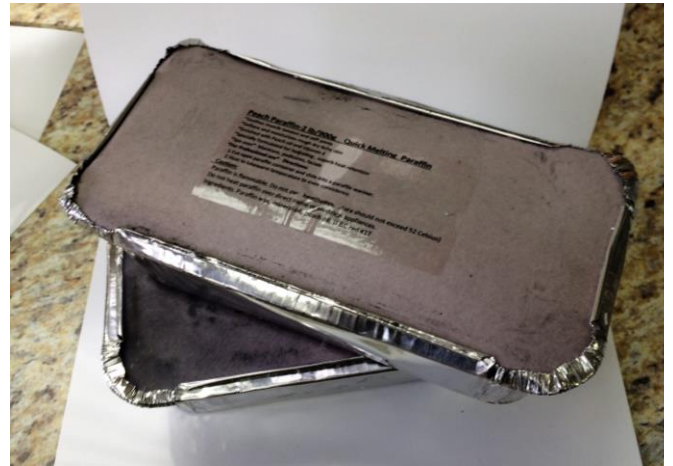
Paraffin wax blocks

The paraffin wax itself has no moisturizing benefits. Benefits come from the lotions that are applied during massage, before the hands are immersed in the wax. When the hands are immersed, the paraffin pushes the lotion the skin into a deeper level than without the wax and is not allowed to evaporate. The temperature of the wax helps penetration by opening pores, helps relieve arthritic pain, and promotes blood circulation and relaxation. Perspiration