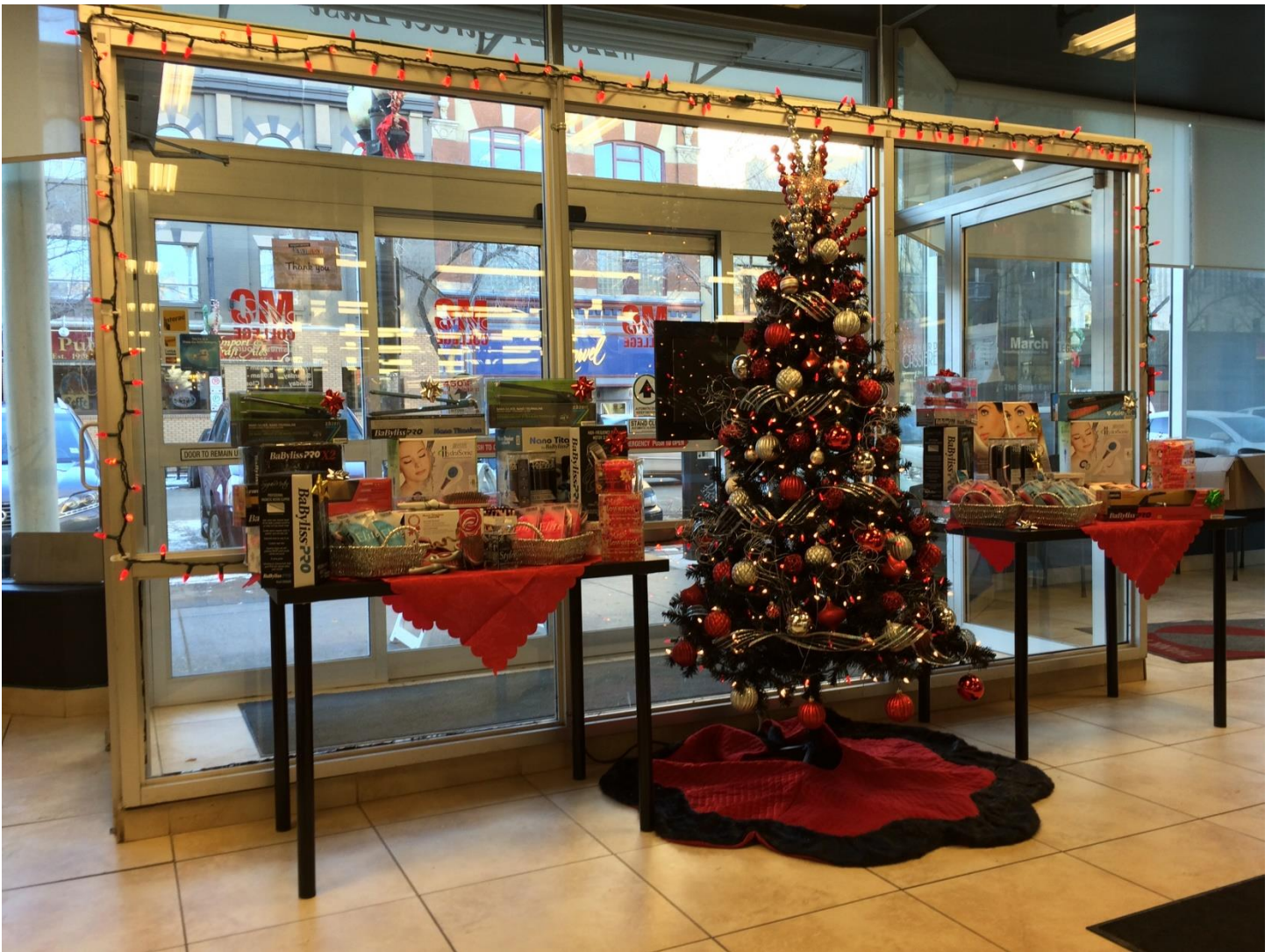
A Christmas display at the entrance of a salon, featuring products that are on sale.

Related products can be placed near each other to increase upselling. For example, a client is looking for a new powder foundation. Place the appropriate brush next to the foundation, and the client may decide to purchase a new brush as well.